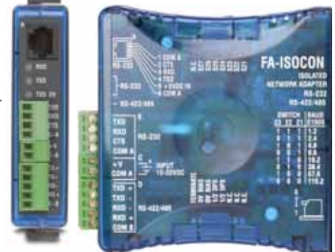
Removable terminal blocks make it easy to connect communication wiring. (Replacement terminal plug kit FA-ISOCOCON-P)