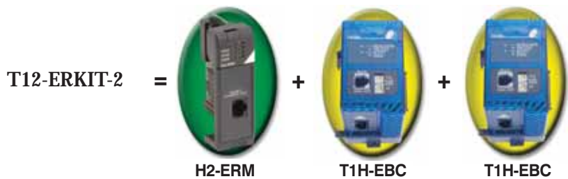
Example kit: T12-ERKIT-2 includes one H2-ERM and two T1H-EBCs.