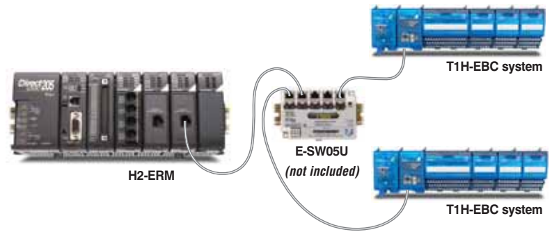
Example of an Ethernet remote I/O system using a T12-ERKIT-2. CPU, bases, I/O modules, Ethernet hub, etc. are sold separately.

A T12-ERKIT-2, shown below, includes one H2-ERM and two T1H-EBC modules. All other necessary hardware, including the CPU, I/O modules, bases, cables and Ethernet hub (if required), is sold separately.