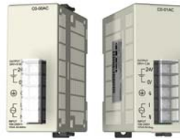
CLICK 24 VDC Power Supply CO-00AC or CO-01AC

Power budget row turns red if maximum allowable power consumption is exceeded for the power supply selected.