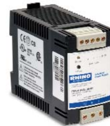
Other 24 VDC Power Supply Example: PSP24-60S